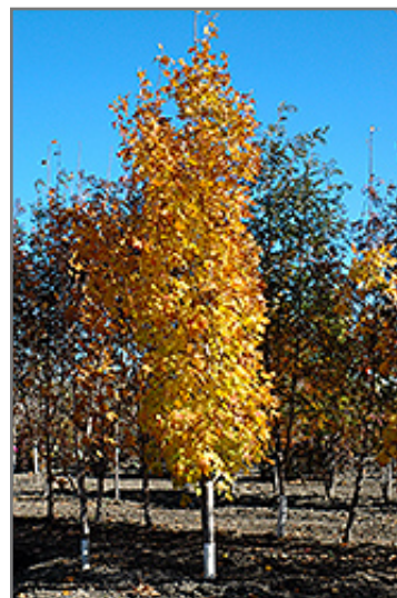
Lord Selkirk Sugar Maple in fall