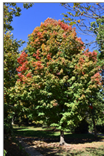
Endowment Sugar Maple