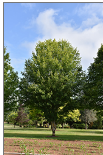
Belle Tower Sugar Maple