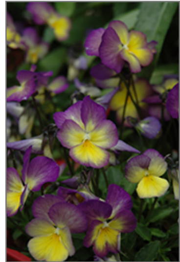
Celestial Starry Night Pansy flowers