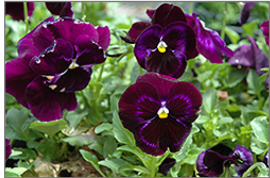
Colossus Neon Violet Pansy flowers