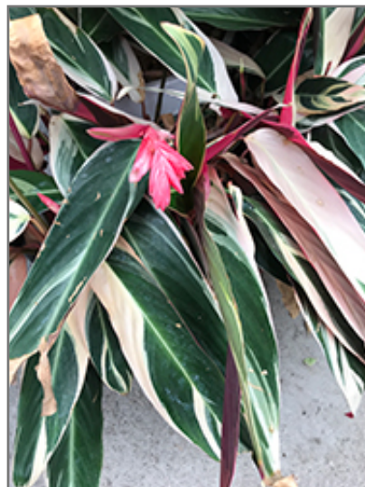
Tricolor Stromanthe flowers

This plant does best in full sun to partial shade. It prefers to grow in average to moist conditions, and shouldn't be allowed to dry out. It is not particular as to soil pH, but grows best in rich soils. It is somewhat tolerant of urban pollution. This is a selected variety of a species not originally from North America. It can be propagated by division; however, as a cultivated variety, be aware that it may be subject to certain restrictions or prohibitions on propagation.