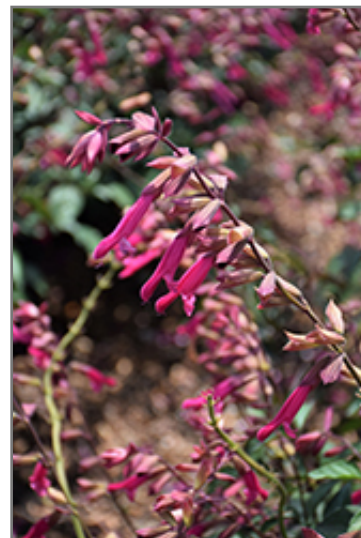
Wendy's Wish Sage flowers