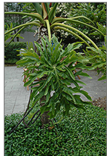
Tree Philodendron foliage