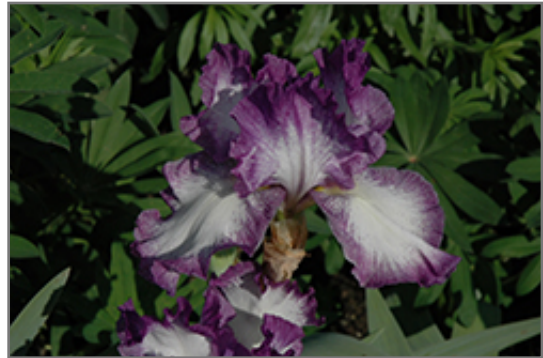
Jesse's Song Iris flowers