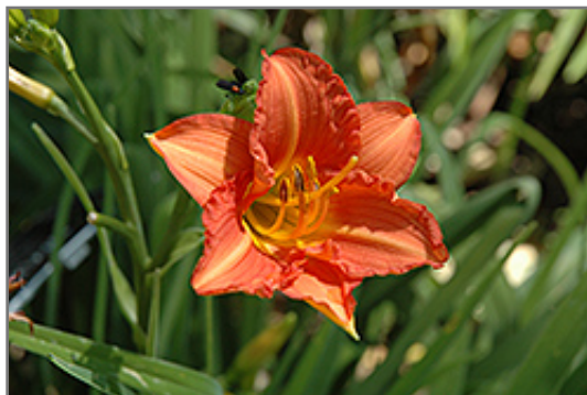
Mambo Maid Daylily flowers