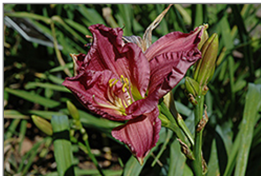
King Of Kings Daylily flowers

King Of Kings Daylily will grow to be about 12 inches tall at maturity, with a spread of 12 inches. When grown in masses or used as a bedding plant, individual plants should be spaced approximately 10 inches apart. It grows at a medium rate, and under ideal conditions can be expected to live for approximately 10 years. As an evergreen perennial, this plant will typically keep its form and foliage year-round.