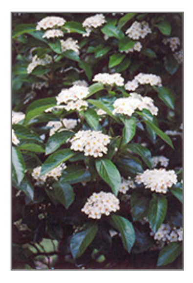
Lavalle Hawthorn flowers