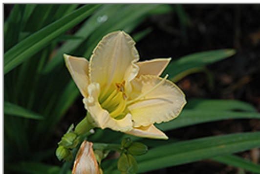
Babylon Sister Daylily flowers

Babylon Sister Daylily will grow to be about 18 inches tall at maturity, with a spread of 18 inches. When grown in masses or used as a bedding plant, individual plants should be spaced approximately 14 inches apart. It grows at a medium rate, and under ideal conditions can be expected to live for approximately 10 years. As an herbaceous perennial, this plant will usually die back to the crown each winter, and will regrow from the base each spring. Be careful not to disturb the crown in late winter when it may not be readily seen!