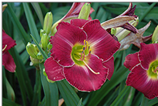
All The King's Men Daylily flowers

All The King's Men Daylily will grow to be about 24 inches tall at maturity, with a spread of 24 inches. When grown in masses or used as a bedding plant, individual plants should be spaced approximately 18 inches apart. It grows at a medium rate, and under ideal conditions can be expected to live for approximately 10 years. As an herbaceous perennial, this plant will usually die back to the crown each winter, and will regrow from the base each spring. Be careful not to disturb the crown in late winter when it may not be readily seen!