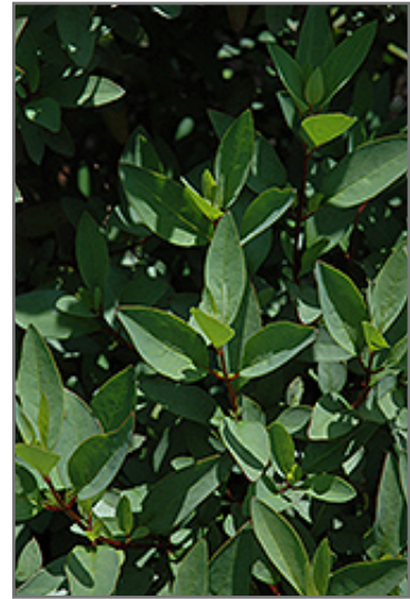
Thryallis foliage

This plant is not reliably hardy in our region, and certain restrictions may apply; contact the store for more information.