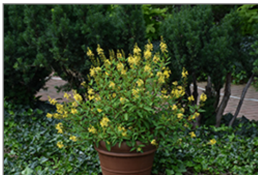
Thryallis in bloom