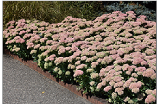
Autumn Joy Stonecrop in bloom