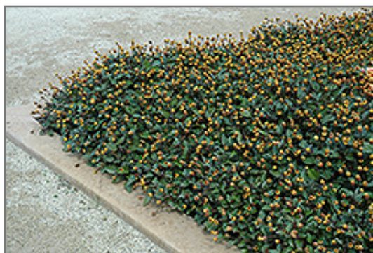
Peek A Boo Para Cress in bloom