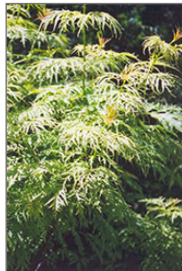
Goldfinch American Elder foliage