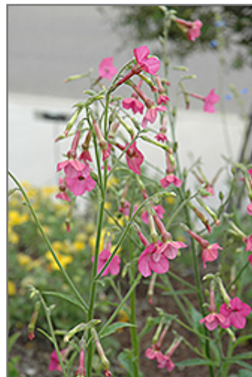
Whisper Deep Pink Flowering Tobacco flowers