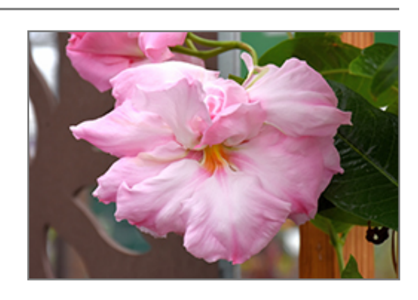
Tango Twirl Mandevilla flowers

Tango Twirl Mandevilla is a fine choice for the garden, but it is also a good selection for planting in outdoor pots and containers. Because of its spreading habit of growth, it is ideally suited for use as a 'spiller' in the 'spiller-thriller-filler' container combination; plant it near the edges where it can spill gracefully over the pot. It is even sizeable enough that it can be grown alone in a suitable container. Note that when growing plants in outdoor containers and baskets, they may require more frequent waterings than they would in the yard or garden. Be aware that in our climate, most plants cannot be expected to survive the winter if left in containers outdoors, and this plant is no exception. Contact our experts for more information on how to protect it over the winter months.