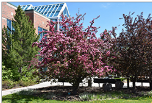
Makamik Flowering Crab in bloom