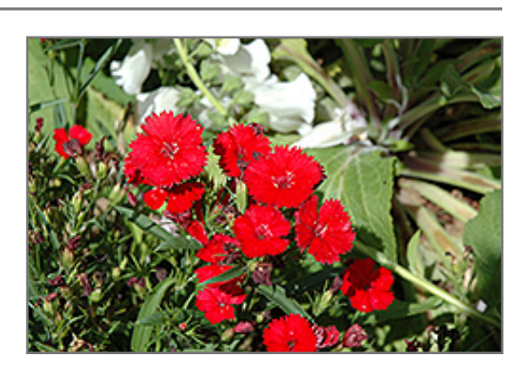
Telstar Scarlet Pinks flowers