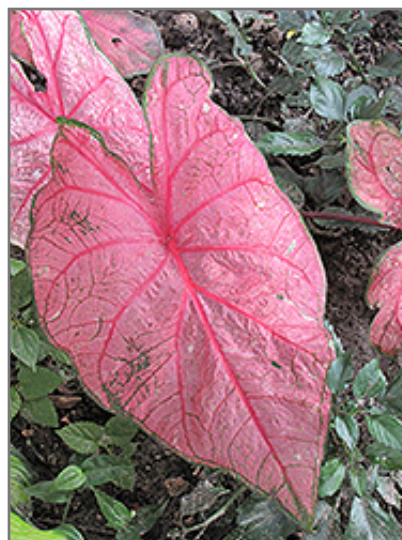
Fannie Munson Caladium foliage