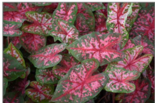
Carolyn Whorton Caladium foliage