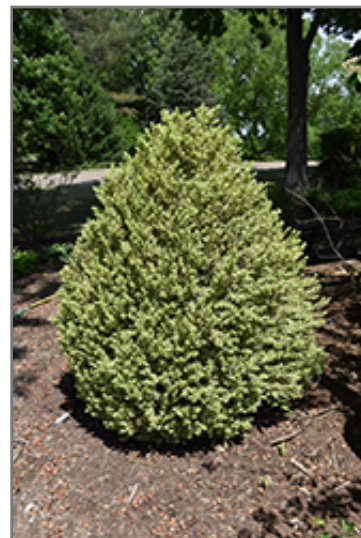
Variegated Boxwood