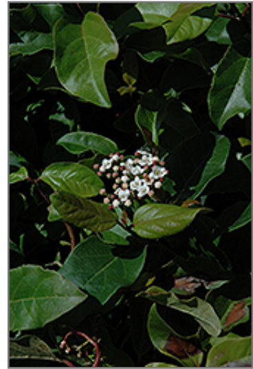
Japanese Viburnum flowers

Japanese Viburnum will grow to be about 8 feet tall at maturity, with a spread of 8 feet. It tends to be a little leggy, with a typical clearance of 1 foot from the ground, and is suitable for planting under power lines. It grows at a medium rate, and under ideal conditions can be expected to live for 40 years or more.