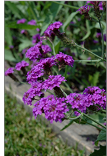
Santos Purple Verbena flowers