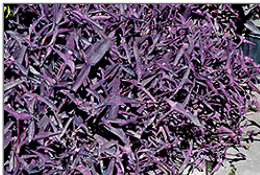
Purple Queen foliage