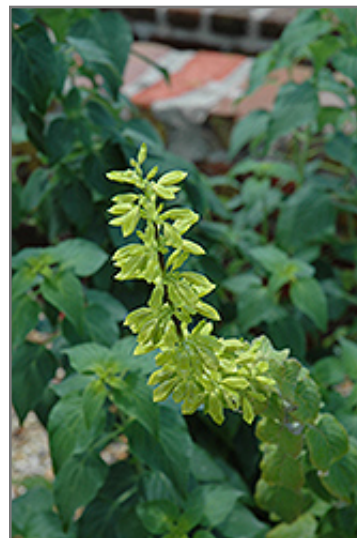
Limelight Mexican Sage flowers