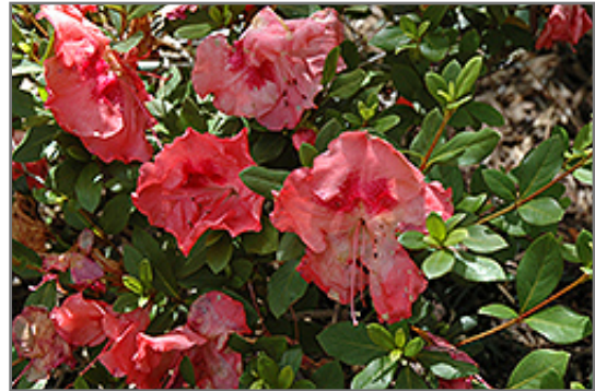
Joan Garrett Azalea flowers

Joan Garrett Azalea will grow to be about 3 feet tall at maturity, with a spread of 4 feet. It tends to be a little leggy, with a typical clearance of 1 foot from the ground. It grows at a slow rate, and under ideal conditions can be expected to live for 40 years or more.