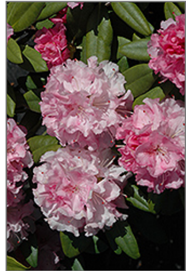
Colonel Coen Rhododendron flowers

Colonel Coen Rhododendron will grow to be about 7 feet tall at maturity, with a spread of 7 feet. It tends to be a little leggy, with a typical clearance of 1 foot from the ground, and is suitable for planting under power lines. It grows at a slow rate, and under ideal conditions can be expected to live for 40 years or more.