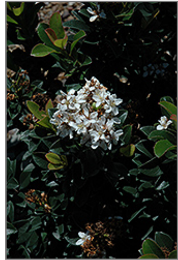
Snow White Indian Hawthorn flowers