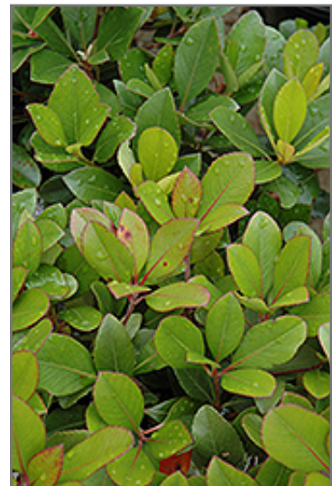
Snow White Indian Hawthorn foliage