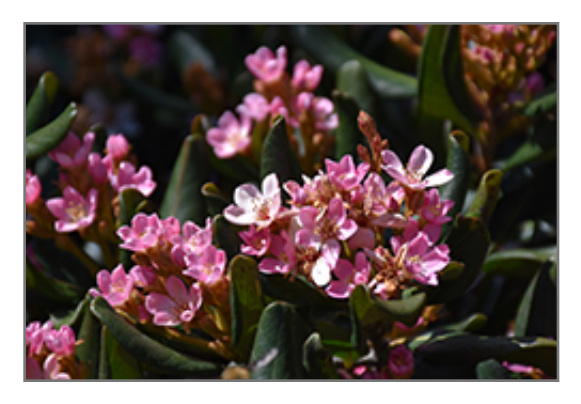
Calisto Indian Hawthorn flowers

This is a relatively low maintenance shrub, and should not require much pruning, except when necessary, such as to remove dieback. It is a good choice for attracting birds to your yard. It has no significant negative characteristics.