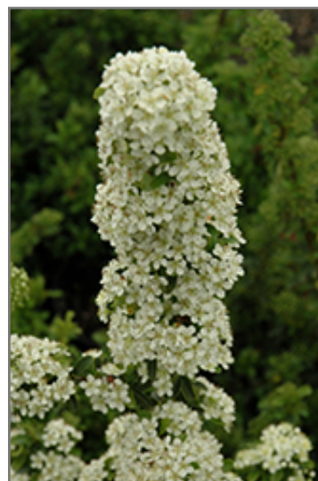
Teton Scarlet Firethorn flowers

Teton Scarlet Firethorn is recommended for the following landscape applications;