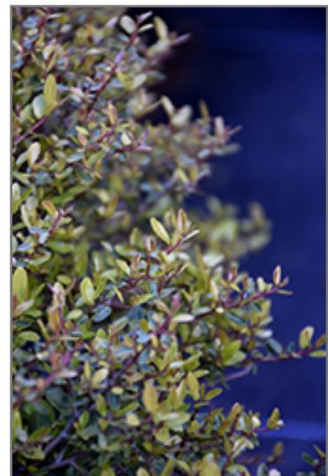
Micron Yaupon Holly foliage