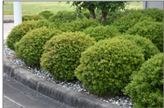
Micron Yaupon Holly