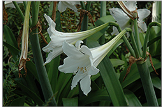
Amputo Amaryllis flowers