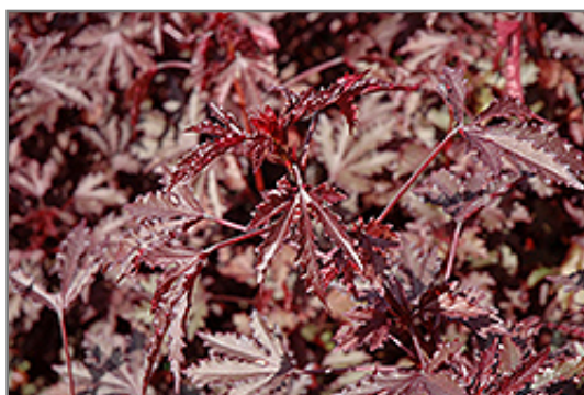
Haight Ashbury Hibiscus foliage