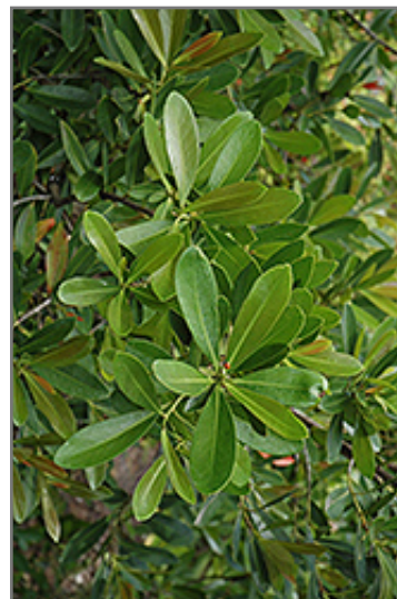
Fried Egg Tree foliage