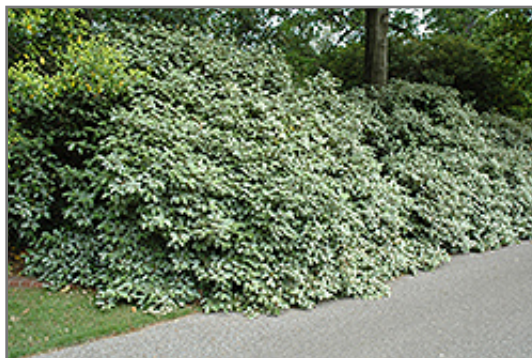
Fruitland Silverberry