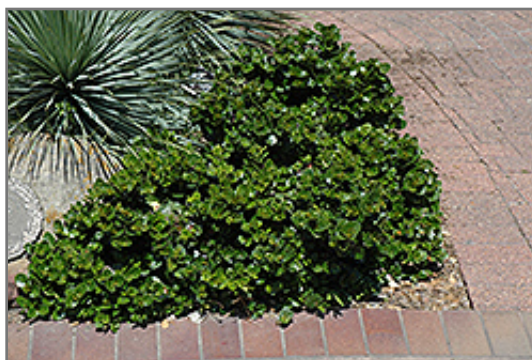
Tuttle's Natal Plum

Aside from its primary use as an edible, Tuttle's Natal Plum is suitable for the following landscape applications;