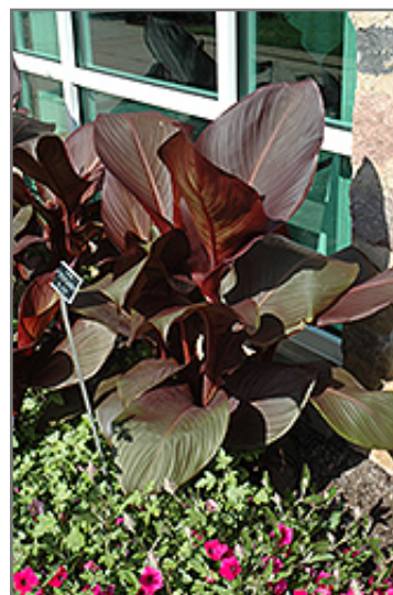
Tropicanna Black Canna

This plant should only be grown in full sunlight. It prefers to grow in moist to wet soil, and will even tolerate some standing water. It is not particular as to soil type or pH. It is highly tolerant of urban pollution and will even thrive in inner city environments. Consider applying a thick mulch around the root zone in winter to protect it in exposed locations or colder microclimates. This particular variety is an interspecific hybrid. It can be propagated by division; however, as a cultivated variety, be aware that it may be subject to certain restrictions or prohibitions on propagation.