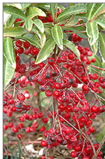
Coral Berry fruit