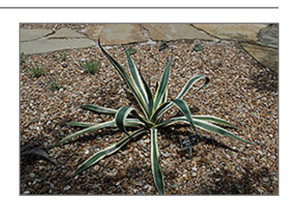
Marginata Alba Agave