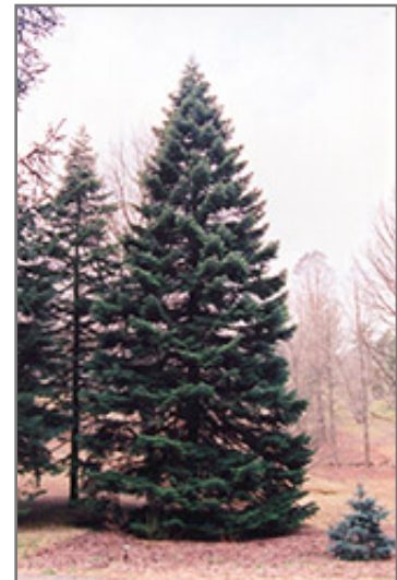
Nordmann Fir

Nordmann Fir will grow to be about 60 feet tall at maturity, with a spread of 25 feet. It has a low canopy, and should not be planted underneath power lines. It grows at a slow rate, and under ideal conditions can be expected to live for 90 years or more.