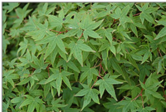
Tama Hime Japanese Maple foliage