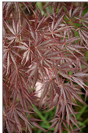
Sherwood Elfin Japanese Maple foliage

Sherwood Elfin Japanese Maple is recommended for the following landscape applications;