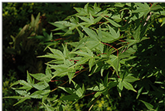
Ryu Sei Japanese Maple foliage

Ryu Sei Japanese Maple is recommended for the following landscape applications;