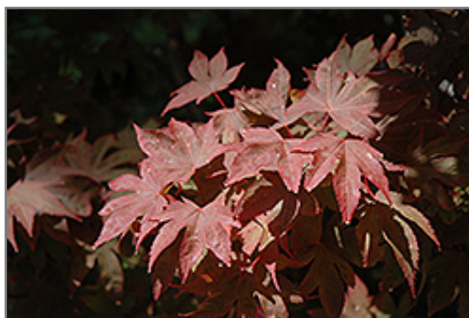
Ruslyn In The Pink Japanese Maple foliage

Ruslyn In The Pink Japanese Maple is recommended for the following landscape applications;