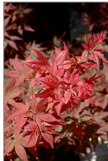
Ruby Stars Japanese Maple foliage