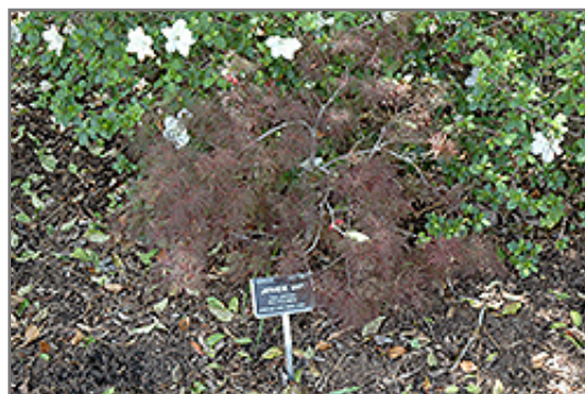
Red Feathers Japanese Maple